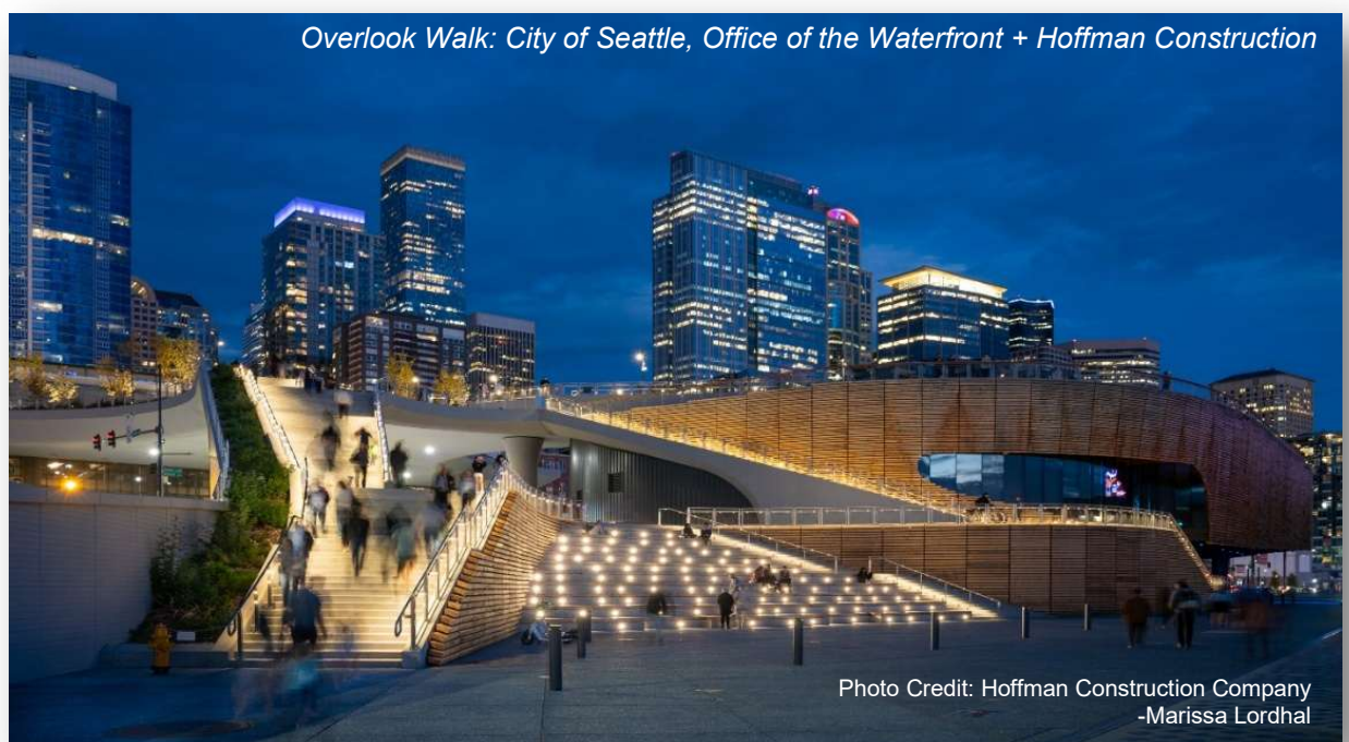
Overlook Walk: City of Seattle, Office of the Waterfront + Hoffman Construction